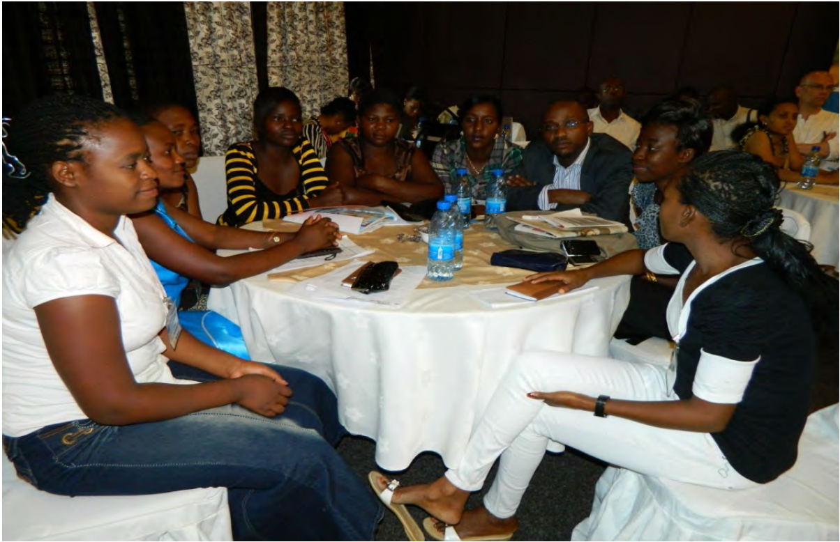
Girls from CDF/FORWARD Project in Musoma & Tarime