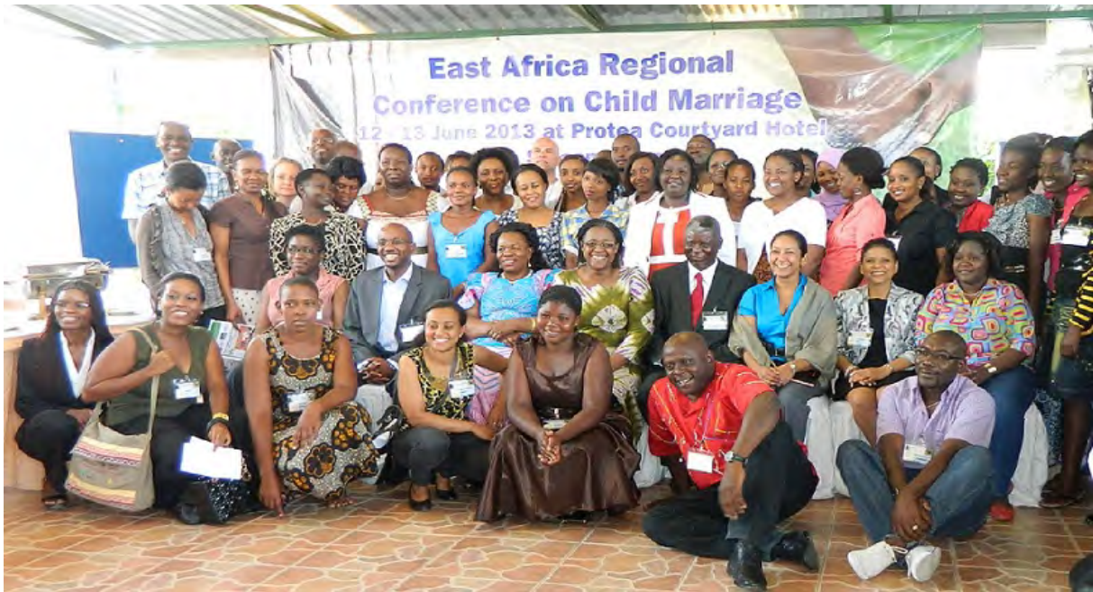
Participants at the conference 12 th June 2013, Dar es Salaam, Tanzania

Children’s Dignity Forum (CDF); Coexist Initiative; Foundation for Women’s Health Research and Development (FORWARD); Girls not Brides-the Global Partnership to End Child Marriage; Graca Machel Trust; Hope Foundation; Legal and Human Rights Centre; MIFUMI; Tanzania End Child Marriage Network Member (made up of 20 organisations); Tanzania Association of Media Women; Tanzania Women Lawyers Association; The African Child Policy Forum (ACPF); Population Council; Raising Voices; UMATI; UNFPA, UNESCO Tanzania; Utu Mwanamke; The Government of Zambia