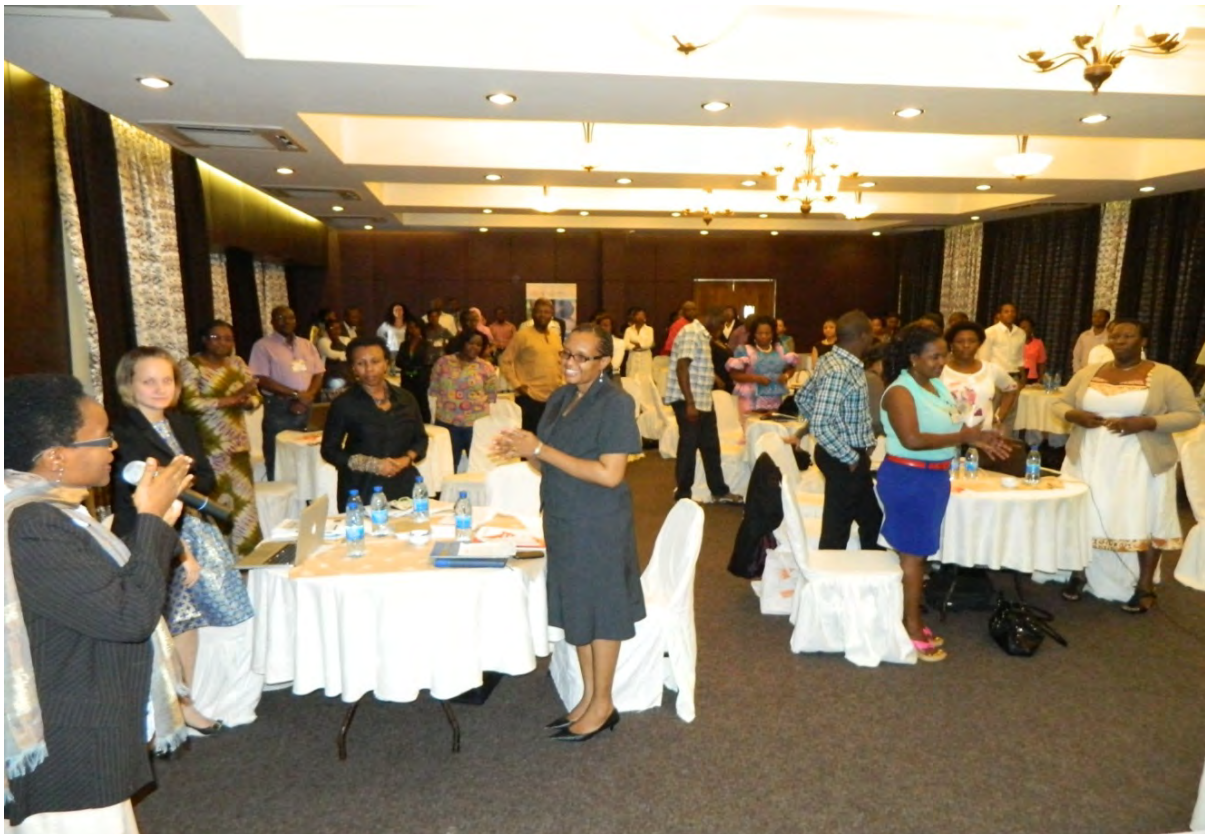
Standing applause for the girls who spoke to the conference about their personal experiences of child marriage.

Finally, a big thank you to all the girls from our project in Mara Region who attended this conference and shared their intimate stories of child marriage. We commend your courage in speaking out and giving us all the inspiration to continue to campaign to end child marriage.