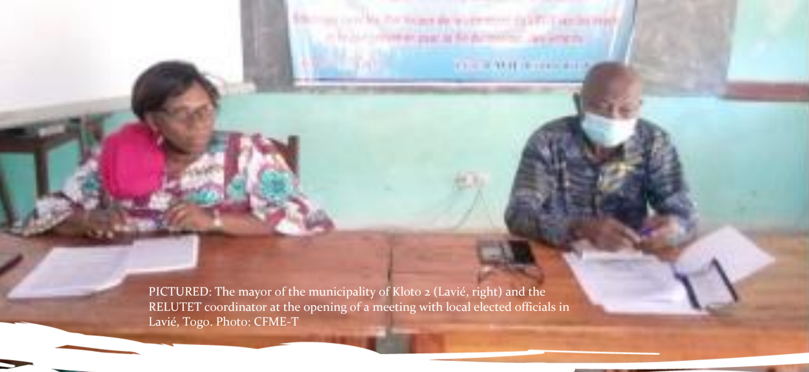
PICTURED: The mayor of the municipality of Kloto 2 (Lavié, right) and the RELUTET coordinator at the opening of a meeting with local elected officials in Lavié, Togo.